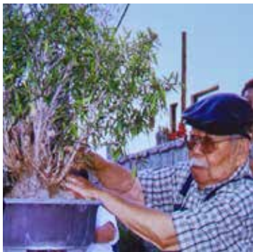
Naka San

Light feeding, particularly of trees that are still showing new growth is permitted at this season. Deciduous flowering and fruiting species may benefit from a low nitrogen high phosphorous high potassium fertilizer (0-10-10 such as Liquinox Bloom) to promote fruit development and strong roots.