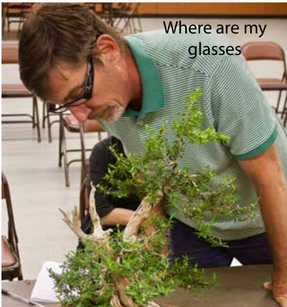
Where are my glasses