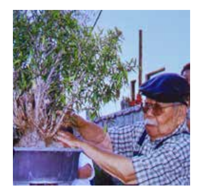
Naka

This is the month to spray DECIDUOUS trees with DILUTE lime sulfur to ward off leaf curl and other insect pests. Do this before the buds enlarge. Cover the soil. Read the directions before you spray. BE CARE-SPRAYING EVERGREENS AS YOUR FOLIAGE MAY SUFFER. Don't spray new tender growth or flowers that have opened with lime sulfur. Always wear EYE PROTECTION as pure lime sulfur which is alkaline can cause big time problems.